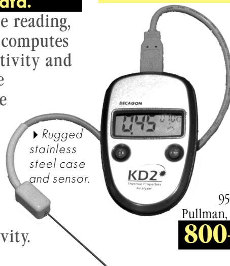
▶ Rugged stainless steel case and sensor.