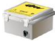
AQUAFLEX Logging Sensor