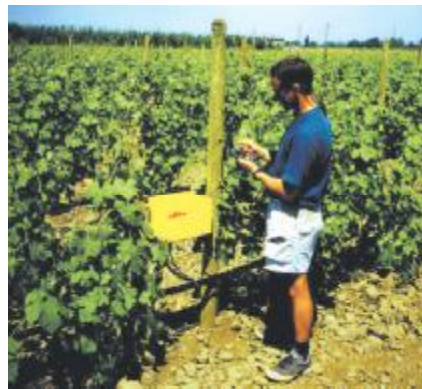
An 8-sensor AQUAFLEX Datalogger installed in a USA vineyard. 'AQUAFLEX is a vital tool for effective irrigation management.'

The most accurate and repeatable analysis of soil moisture of any system available.