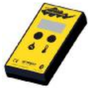
AQUAFLEX Handheld Reader