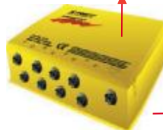
AQUAFLEX Datalogger, 2 and 8 sensor options