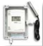
Protective Case for LCD Logger U14-CASE-4x 1.7 x 12.7 x 5.7 cm (6.75 x 2.25 in) 315.2 g (11.2 oz)