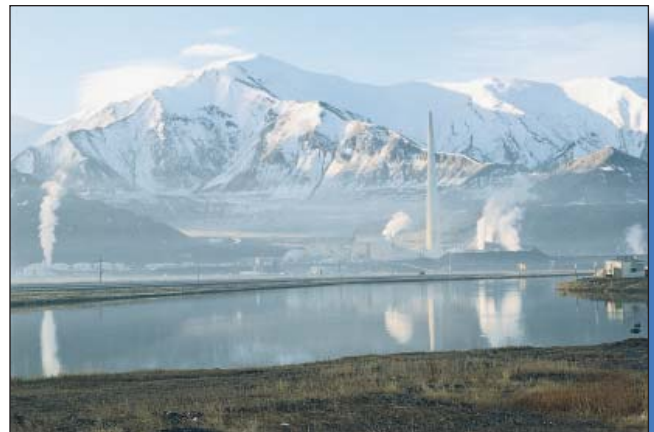
The CR3000 can be used in networks of dataloggers that continuously monitor air quality.