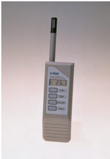
The Vaisala HUMICAP® Hand-Held Humidity and Temperature Meter HM34 provides accurate spot checks of humidity and temperature.