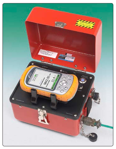
Model GK-405 VW Readout Dock, shown with the compatible Model GK-604-6 Inclinometer Field PC.