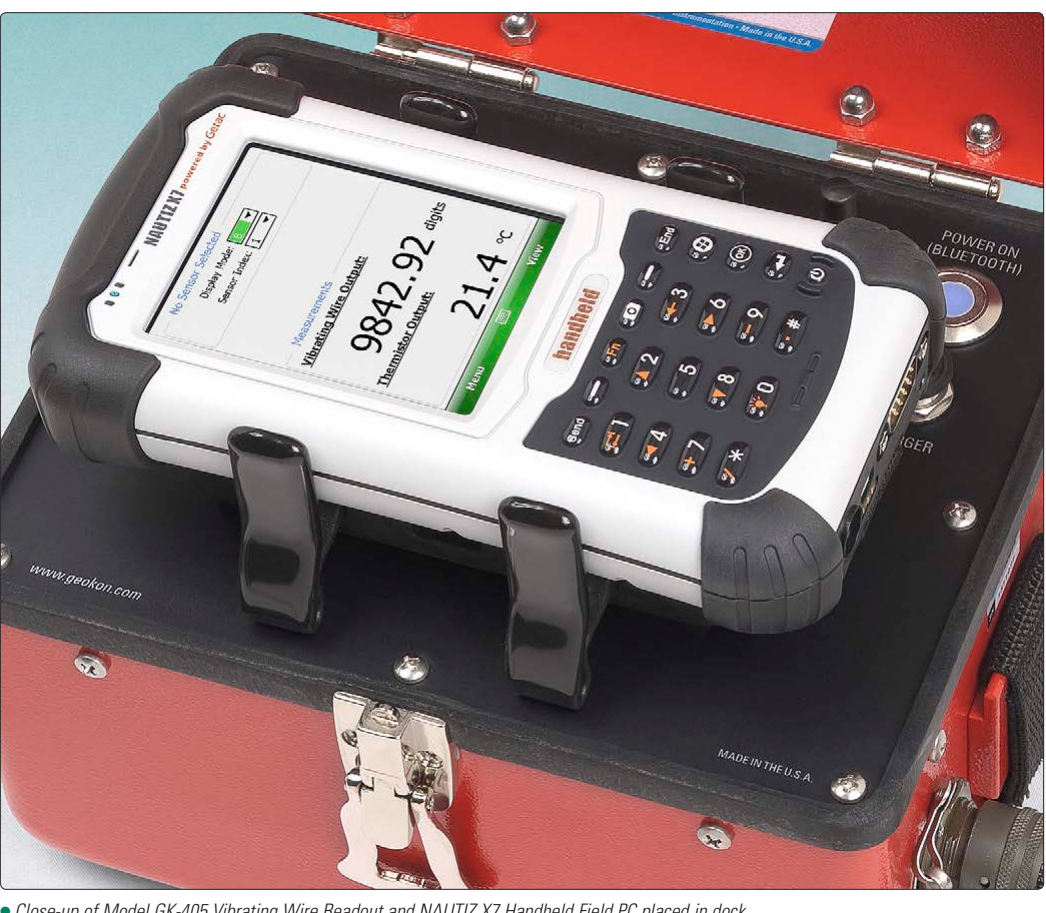
Close-up of Model GK-405 Vibrating Wire Readout and NAUTIZ X7 Handheld Field PC placed in dock.

• Model GK-405, shown with Model 4900 Vibrating Wire Load Cell, with Handheld Field PC removed from the Dock.