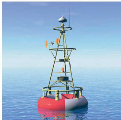
The PTB110 can be used in data buoys.

The compact PTB110 is especially ideal for data logger applications as it has low power consumption. Also an external On/Off control is available. This is practical when the supply of electricity is limited.