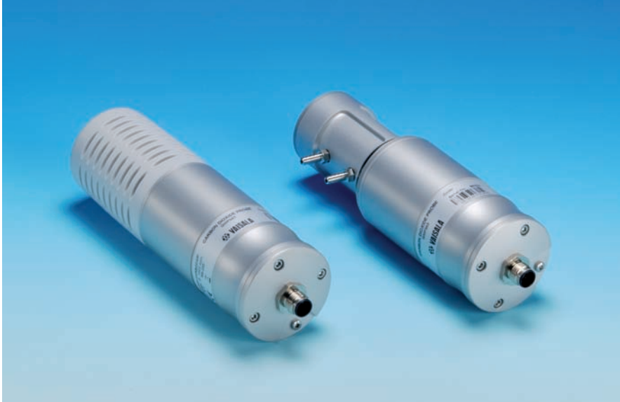
The GMP343 is available as an open path, diffusion aspirated model (left) and as a flow-through model (right).