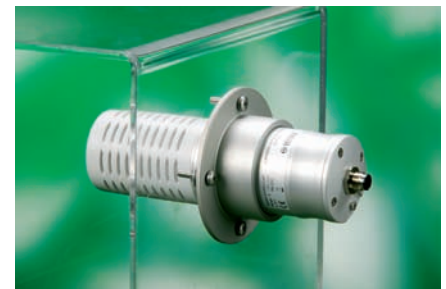
With the optional mounting flange, the GMP343 can for example be installed directly into a soil respiration box. The diffusion-aspirated probe eliminates sampling systems and errors related to pressure differences caused by pumps.

Each GMP343 is calibrated using ±0.5 % accurate gases at 0 ppm, 200 ppm, 370 ppm, 600 ppm, 1000 ppm, 4000 ppm and 2 %. Calibration is also done at four temperature points, -30 °C, 0 °C, 25 °C and 50 °C. If needed, the customer can recalibrate the instrument using the multipoint calibration (MPC) feature allowing up to 8 user-defined calibration points.