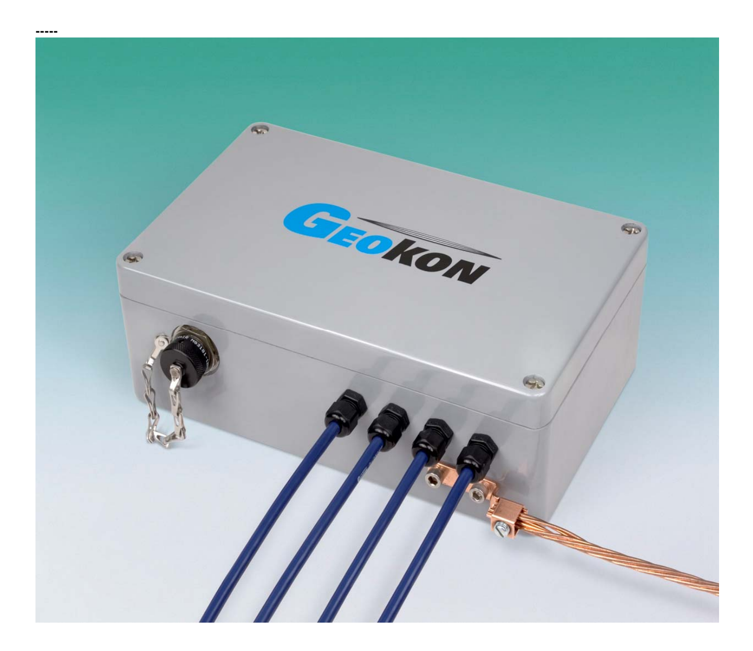
Figure 1 LC2X4 4-Channel VW Datalogger

The comma delineated ASCII output format allows for easy importing into popular spreadsheet programs such as Lotus 1-2-3<sup>™</sup> or Microsoft Excel<sup>™</sup>. See Appendix D for sample data files.