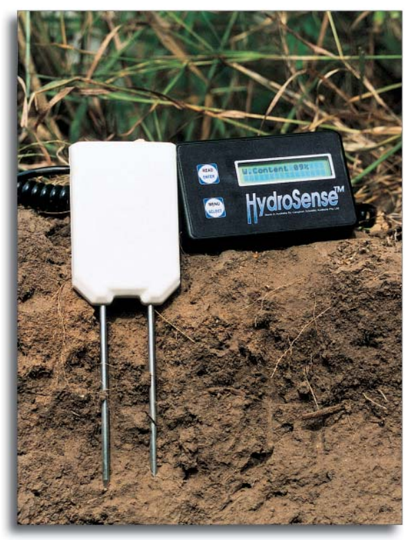
The portable HydroSense provides instant measurements, displayed as soil water content or water deficit.